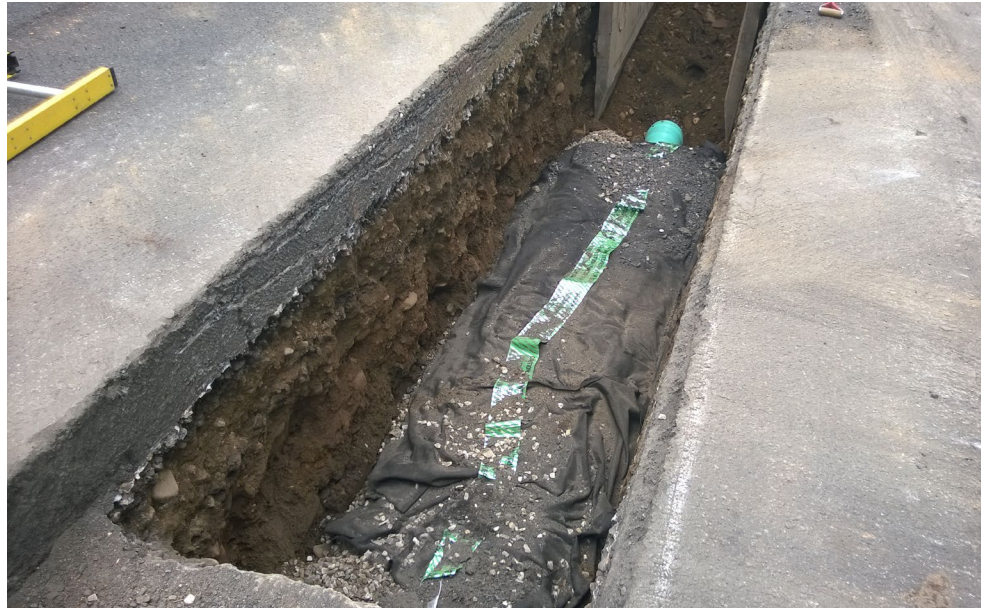
Point repair of a 8-inch VCP gravity sewer prior to Cured-In-Place lining.

We have worked closely with the City's Department of Public Utilities to reduce excess I/I in the sanitary collection system and improve capacity, management, operations and maintenance of their infrastructure. Furthermore, Kleinfelder has led the program to meet the requirements of the NPDES Phase II Stormwater Permit. Duties under this contract have included watershed and sewer infrastructure modeling, GIS surveying and mapping, capital planning, design of infrastructure improvements and upgrades, IDDE, environmental permitting, traffic engineering, and construction management. A representative sample of these services includes the following: